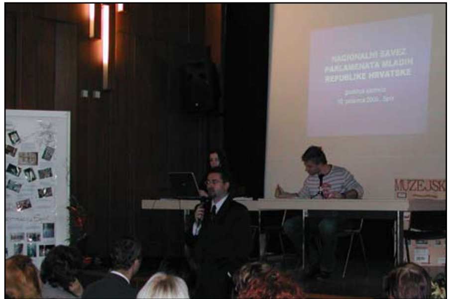
A Croatian class presenting its Project Citizen portfolio.

But for the war, I would not be there aiding their effort towards democracy. I would not have met the latest bureaucrat from Ministry of Education. I would not have met the wizened folks from the US Embassy. I would not have watched the freshest faces of democracy espouse on their Project Citizen activity. I would not have had an