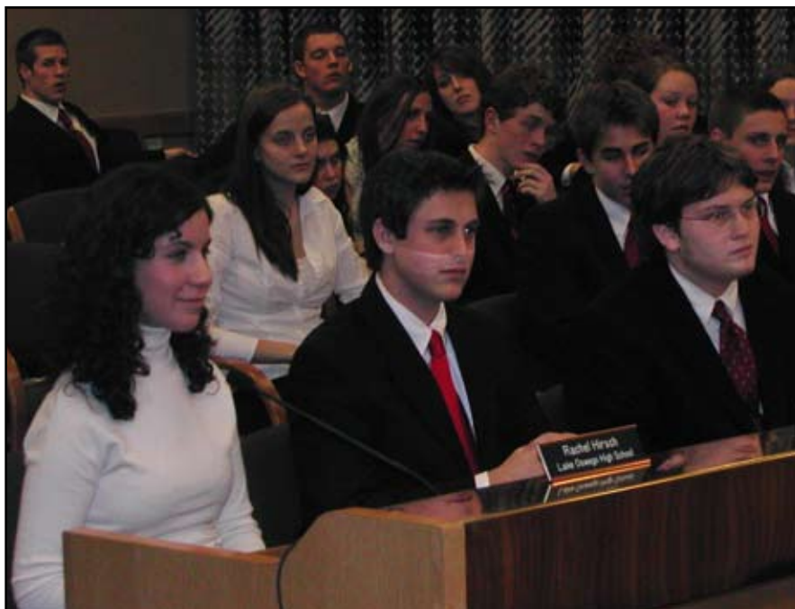
Students from across Oregon compete at the annual high school We the People State Finals. At the top of the page, the 1st place team from Grant High School, Portland.

For more information on Oregon's We the People program, not only for high school but also upper elementary and middle school, contact Classroom Law Project.