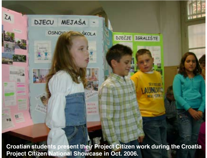
Croatian students present their Project Citizen work during the Croatia Project Citizen National Showcase in Oct. 2006.

Project Citizen was the centerpiece of the trip. The delegation witnessed Croatia's National Showcase where students – preschool through high school – displayed their work on civic participation. Thirty-